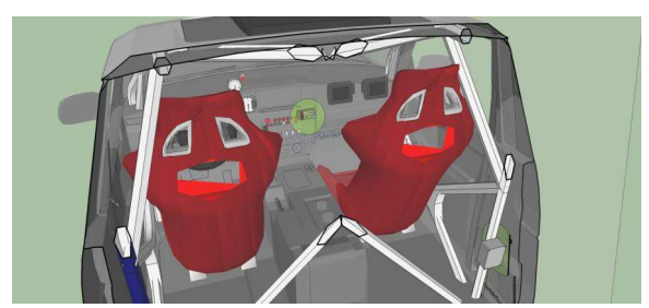
Pic. No. 5.: How to install 3.4