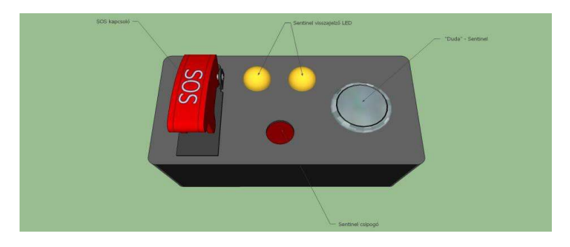
Pic. No. 2.: SOS Panel Sizes: 95x48x67mm Weight: 120 g

-Send SOS signal devices within range. This feature will be active if on the SOS panel, the SOS switch is turned on. Send the device continues the signal, until the SOS switch is turned on. In the case where a device receives the SOS signal, on the SOS panel the red and blue LED will blink, with a pulse (0.5 s) alarm signal, as long as is still within range. This feature requires a power supply operation.