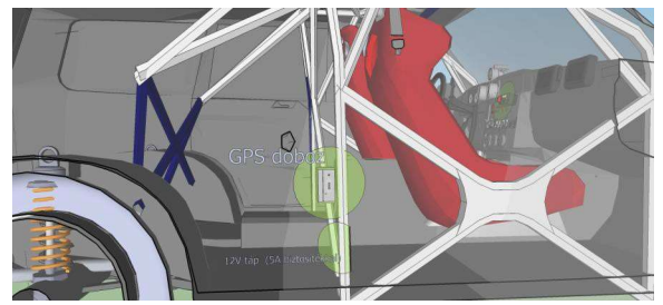
Pic. No. 3.: How to install 1.4

vehicle antenna. The device must be fixed in the right column B with 2 clamps so that the device does not move and the visibility ensured.