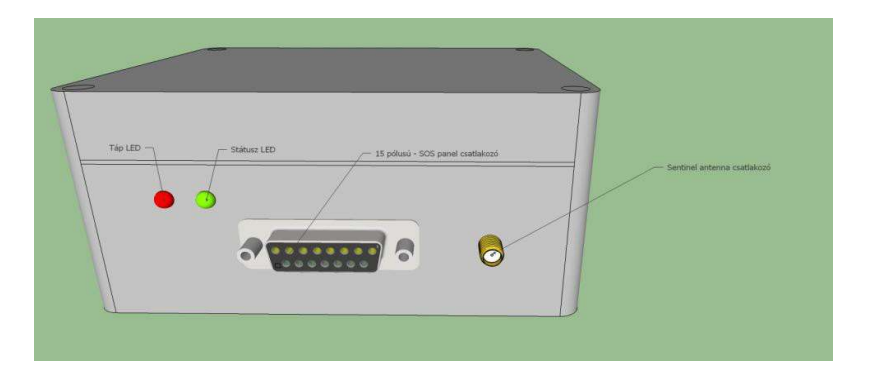
Pic. No. 1.: GPS box Sizes: 115x90x55mm Weight: 340g + pipe clamps 110g

More info GPS System: +36 30 241 31 11 Mr. Zsolt MARTON